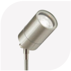
Matching Acero GU10 Spike Light see p360