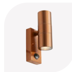
Copper - PIR